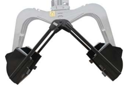
Grapple Arms Slip Into Sand Bucket & Hold In Place Via Gravity