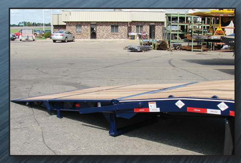
Double Incline Beavertail with Hydraulic Bi-fold Ramps