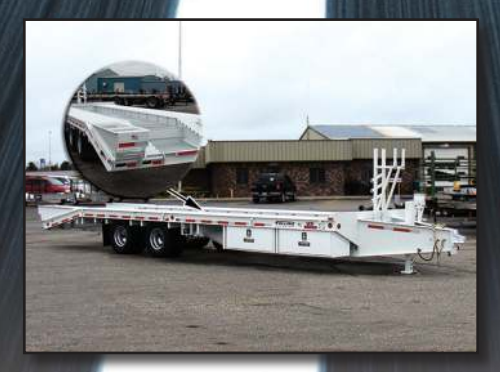
Custom Double Deck Well, spare tire cage, 4 lockable toolboxes, hose rack, floor plate deck. with Customer's salt/ice spraying systems.