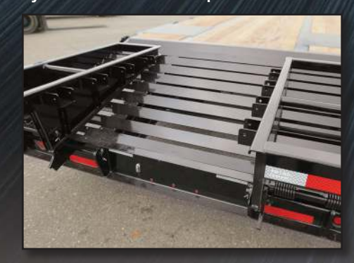
4" x 4" Timber Pockets