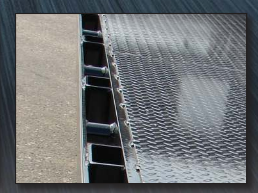
Rub Rail with Stake Pockets and Pipe Spools