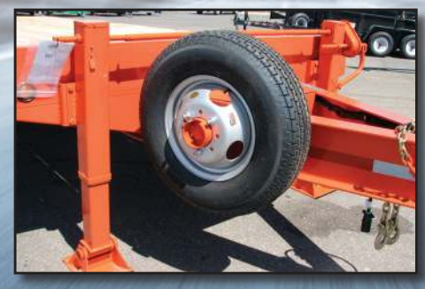
140,000 lb. Twin 2-Speed Jack, Spare Wheel & Tire Mounted