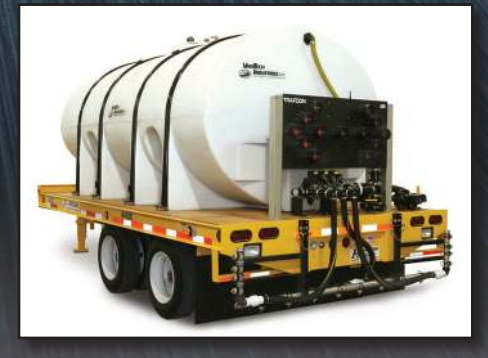
Custom Straight Deck built to be mounted