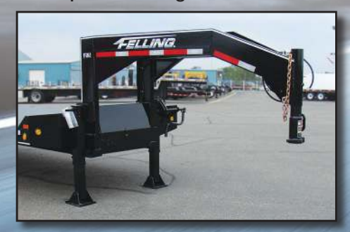
2-5/16" Gooseneck Coupler