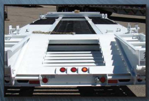
Bucket Well in Beavertail