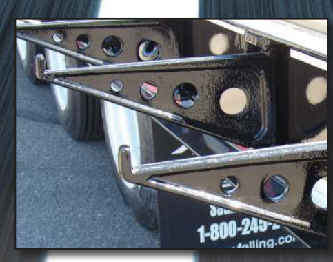
Swing-Out Outriggers with 10" Side Channel