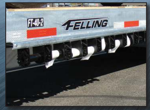
Sliding 4" Belt Winch and Track for Sliding Belt Winch