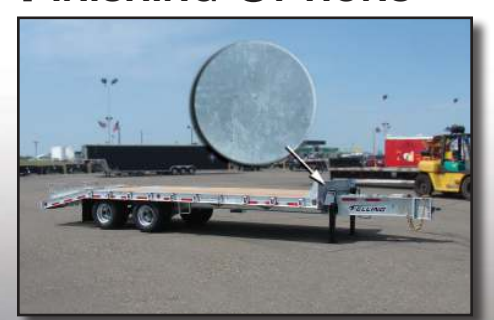
Hot Dip Galvanizing