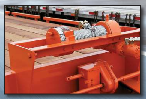
Industrial Winch & Mount