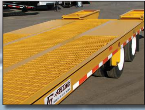
Bar Grate or Tread Plate