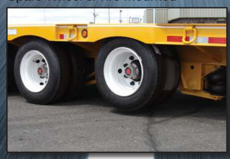
Air Lift Axle (Requires Air Ride)