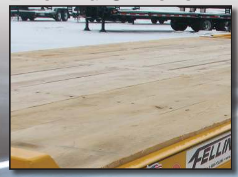
Wood: White Oak 2" Full, White Oak 2" Nominal, Angelim Pedra/Apitong