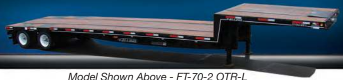
Model Shown Above - FT-70-2 OTR-L