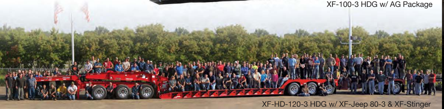
XF-HD-120-3 HDG w/ XF-Jeep 80-3 & XF-Stinger

To learn more about us, have us mail you a specific full color brochure, or locate our nearest Felling Dealer, go to www.felling.com or give us a call at 1-800-245-2809 .