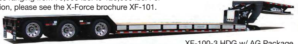
XF-100-3 HDG w/ AG Package

Payload capacities ranging from 70,000 lbs. to 120,000 lbs. For detailed information, please see the X-Force brochure XF-101.