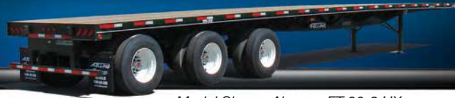
Model Shown Above - FT-80-3 HX