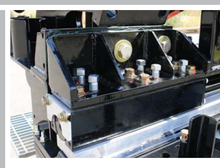
Utilizing the largest adjustable slide track bushing in its class, the EZIV extension maintains integrity of the slide track function for reduced lifecycle costs and superior performance.

Creating a safer, more productive environment for crews, the EZIV continues to set the standard for contractor focus. Featuring rubber isolated 20" (508mm) deep foldable walkways, the EZIV provides a comfortable and safe operating platform. And with its conveniently located cup holders, 110v outlets for accessories, depth rods and holders, shovel holders, clip board holder and legendary Carlson oven*, no other screed can match the attention to the needs and wants of contractors like the EZIV.